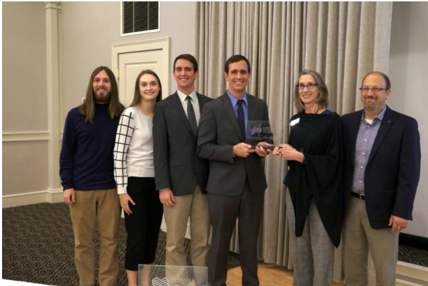
Omaha Biofuels Coop 2017 Service Provider of the Year

“Receiving recognition for our efforts serves to remind us that while our work is difficult, messy, and often unnoticed, it serves an important role in the total recycling market in our community.”