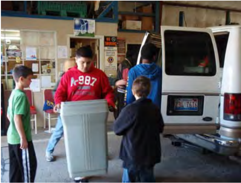
Images of the Crete Recycling Drop-off Center