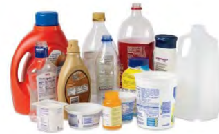
Plastic Bottles and Containers #1-7

Ascertain local program guidelines to learn if bottles that contained antifreeze, bleach, chemicals, motor oil or other potentially hazardous materials are acceptable at end markets and processors before educating/allowing residents to place these in recycling drop-off bins.