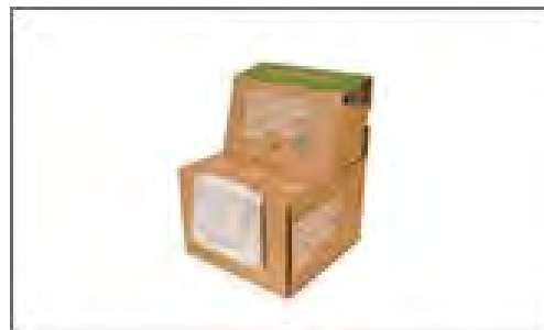
Call2Recycle collection box

All small batteries should be taped over prior to dropping off for recycling: Alkaline, Button, Lithium, NiCad and Rechargeable, in order to help prevent fires during storage and transport!