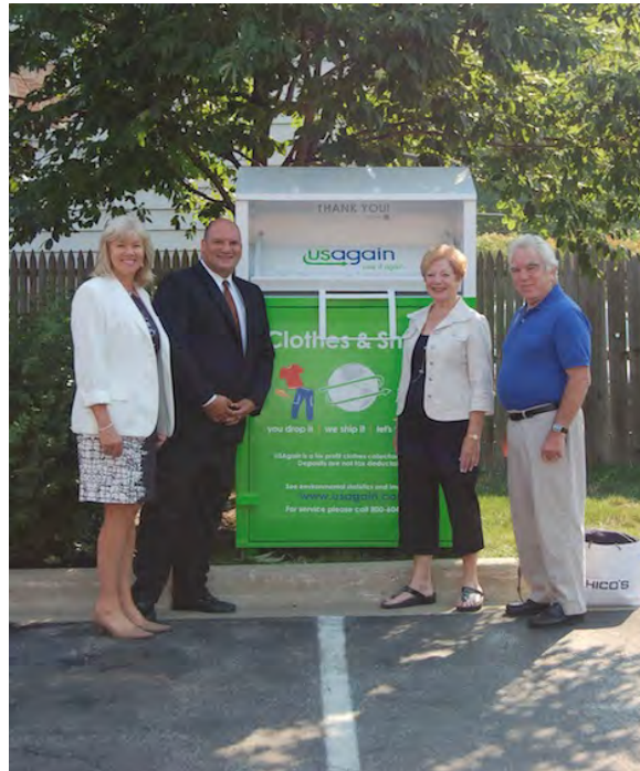
Textile collection box in West Deerfield Township, Illinois