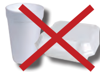
foam / polystyrene