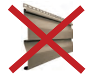
pvc, vinyl siding