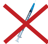
syringes, needles, sharps, medical waste