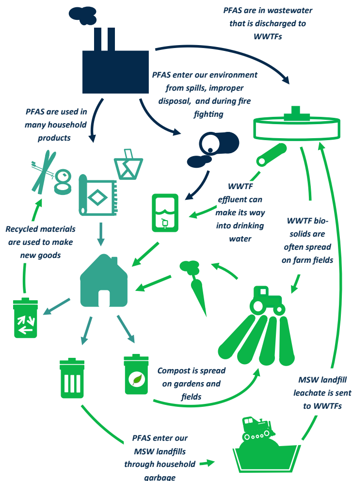
Figure 2: PFAS do not readily break down and when discarded, they flow through our waste systems and into the environment.