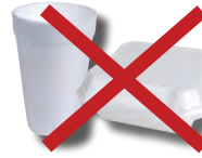
foam / polystyrene