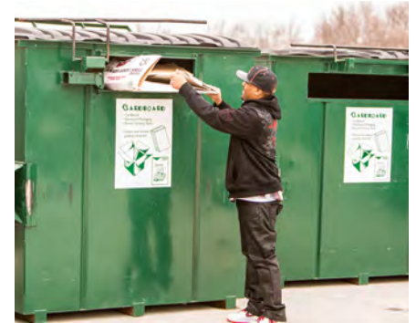
A resident recycles cardboard at one of the City's public recycling drop-off sites.

Please visit recycle.lincoln.ne.gov for additional educational materials and videos in multiple languages.