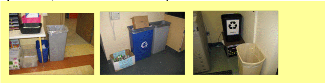
Figure 3.5: Examples of Second-Generation Container Systems