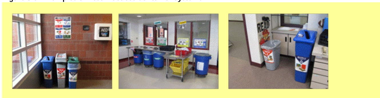
Figure 3.6: Examples of Best Practices Container Systems