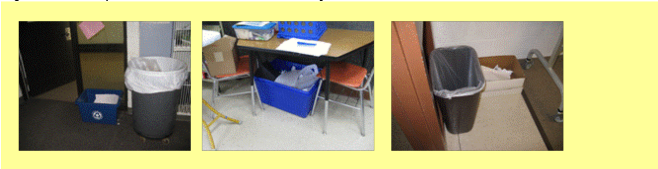
Figure 3.4: Examples of First-Generation Container Systems