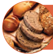
Day-old Bread Croutons or breadcrumbs