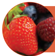
Leftover Fruit Smoothies or dessert topping