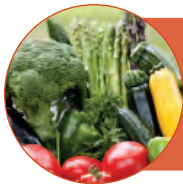
Vegetable Trimmings Base for soups, sauces and stocks